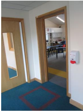
This is a picture of the classroom door!

Our classroom is on the East side of the school and is near Diana and Neptune class, go through the double doors and down the corridor.