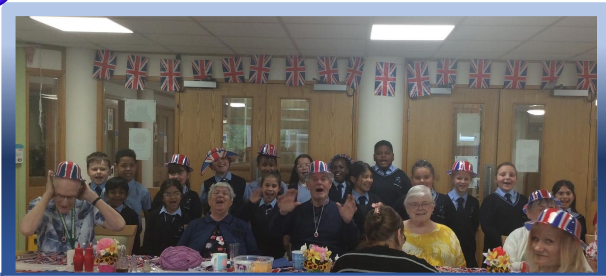
Discovery choir had a lovely time at Bishopsfield care home celebrating VE Day with the residents. The children sang VE songs and read poems.